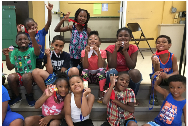
The Brogan Open Water Classic benefits the Malachi Center Urban Kids' Swim Camp. We are proud to be "Big Swimmers helping Little Swimmers."