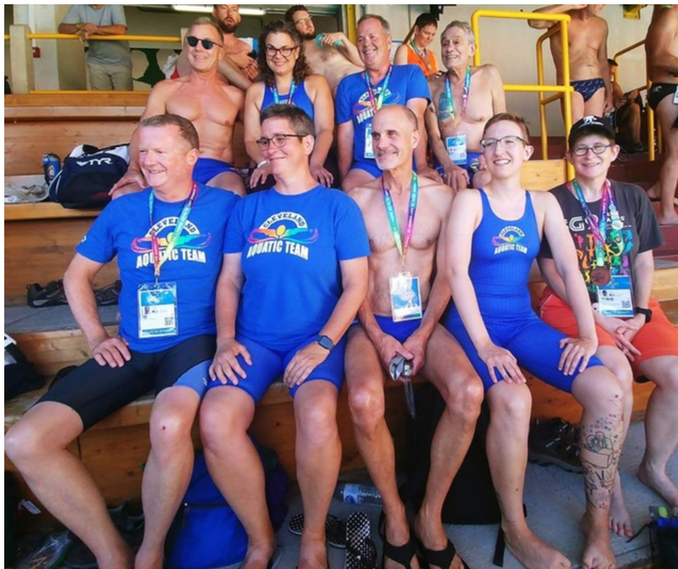
Gay Games X Paris 2018